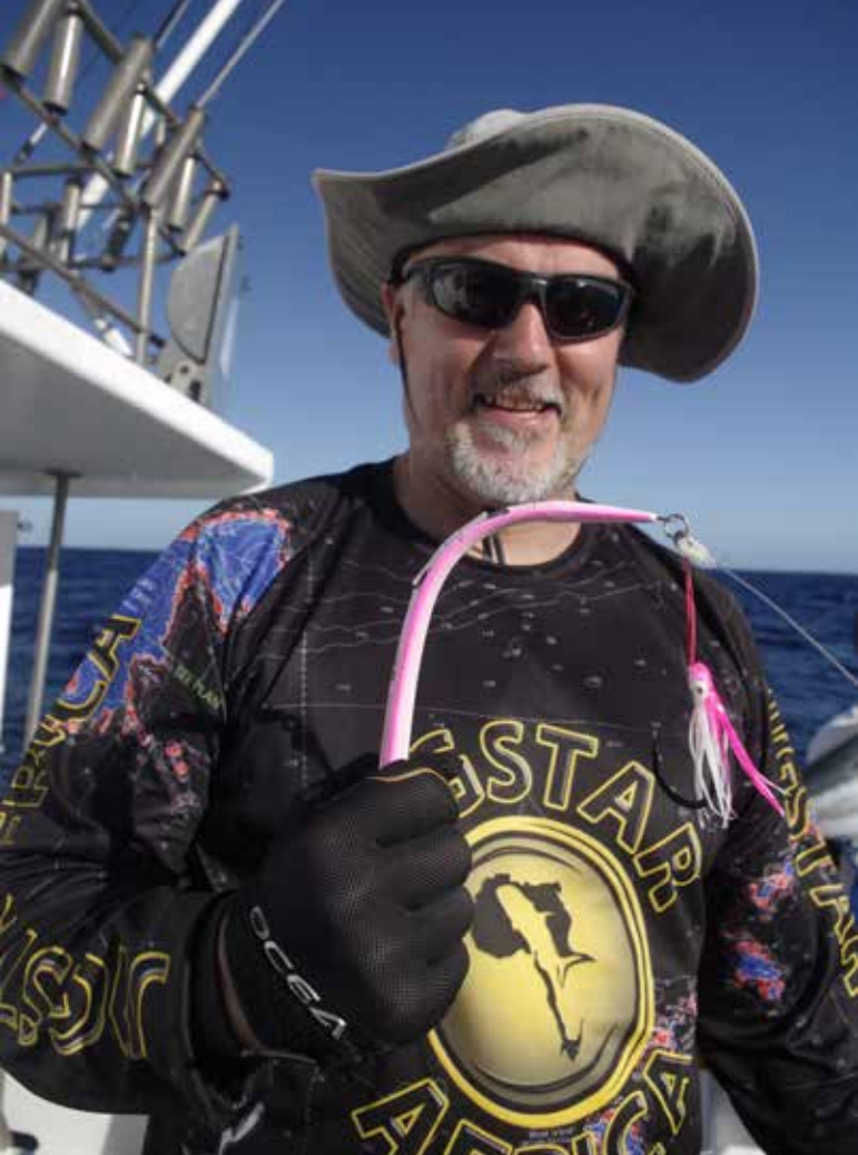
Example of how hard these fish hit the jigs.